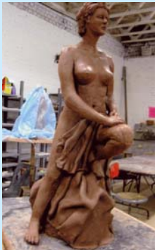
Sculpture by Dave Rakshit

On October 5th members will have an opportunity to learn about sculpture. Al will demonstrate sculpting with clay used in automotive sculpting.