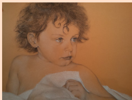
Little Claire by Tim O'Keefe

Plymouth Community Arts Council Inspired 3 Members Exhibit & Holiday Reception 774 N. Sheldon Road Exhibit runs thru December 28, 2016 www.plymoutharts.com