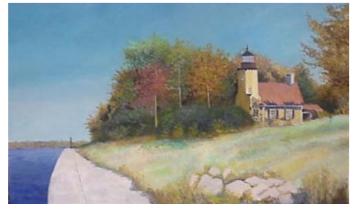
Lighthouse, Acrylic by Elmer Reeves