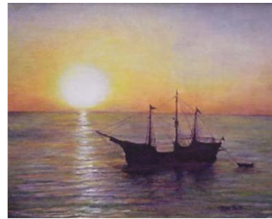
Mexican Seascape, Oil by June Porta