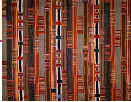
Textile from Africa