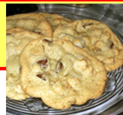
SNACKS FOR MAY