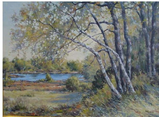
The Pond, Oil by David Lamb

Note from the editor: Hope art is properly labeled, had to guess on some!