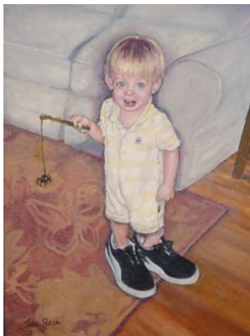
Little Big Foot, Oil by June Porta