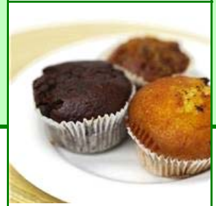
SNACKS FOR JUNE Lonnie Haines