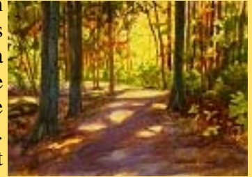
Example of watercolor painting.