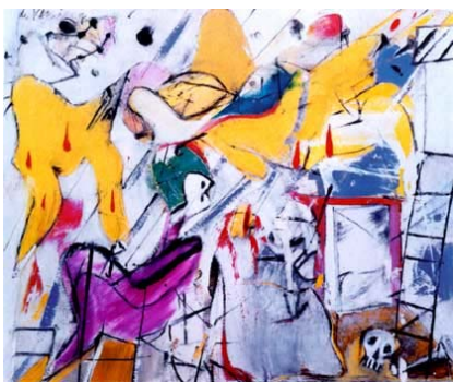
Abstraction 1950 by Willem de Kooning