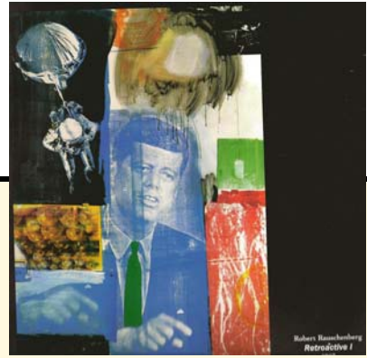
Retroactive I, 1963 by Robert Rauschenberg