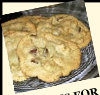
SNACKS FOR September ~ Liz Gullikson