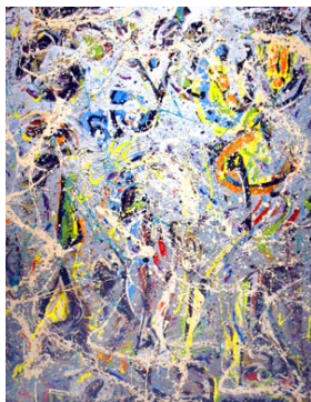
Galaxy by Jackson Pollock