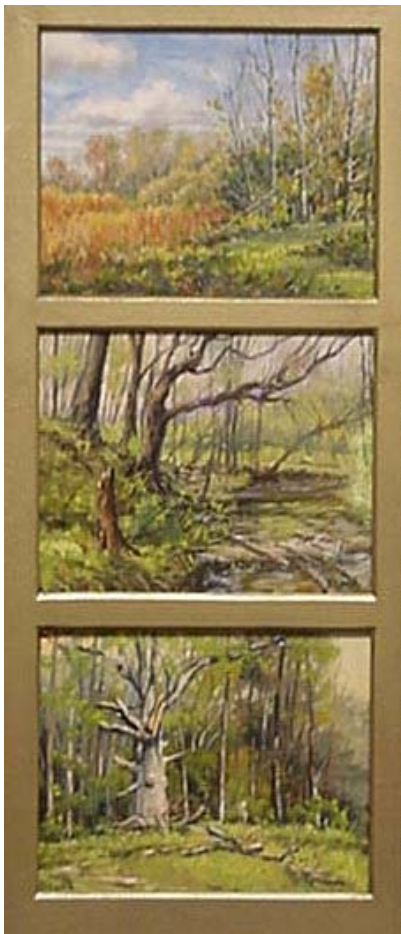
FIRST PLACE Landscape, Oil triptych by David Lamb