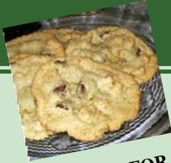
SNACKS FOR September ~ Susan Aitken