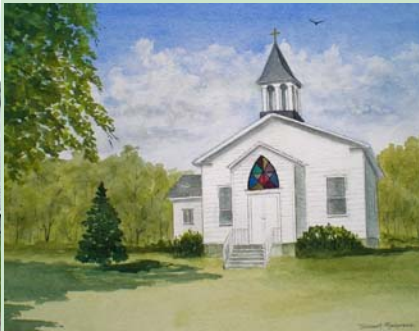
Church at Greemead , watercolor by Vincent Maiorana