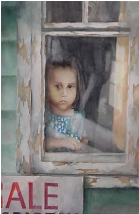
Can't Remember!, Watercolor

The hat that might interest you most, however, is my foray into illustration. Through the years, I have illustrated twelve children's books