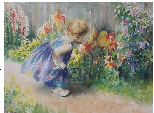
Smell the Flowers, Watercolor