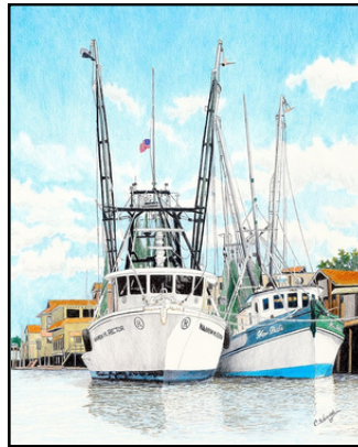
SECOND PLACE: Chuck Schroeder Shrimp Boats