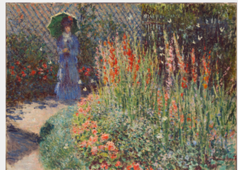
Rounded Flower Bed Claude Monet