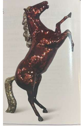
Horses on Parade