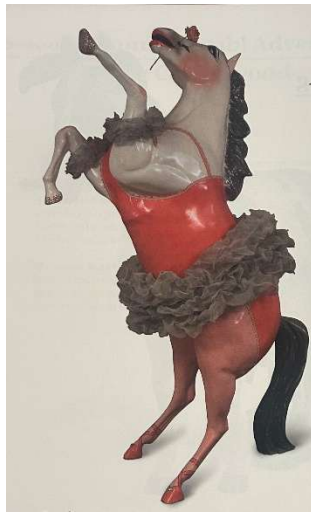
Horses on Parade