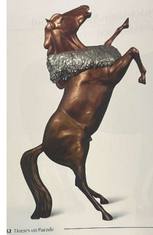
Horses on Parade