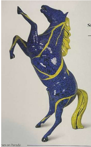
Horses on Parade