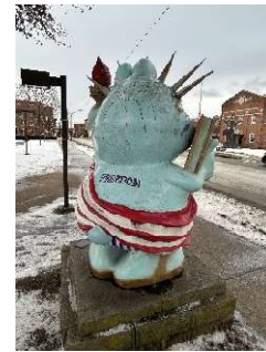
Horses on Parade