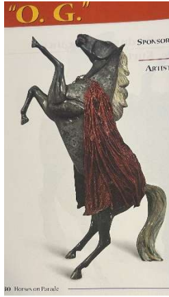
Horses on Parade