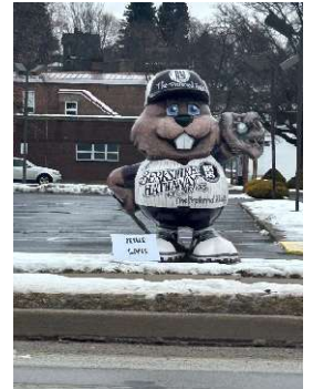
Horses on Parade