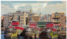
5th Place: Chuck Schroeder