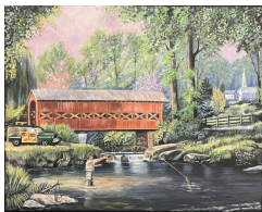
6th Place: Angie Weldon